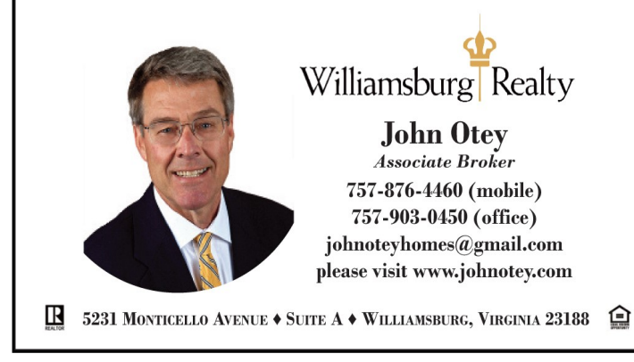
SALES ♦ LISTINGS ♦ PROPERTY MANAGEMENT